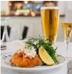
Beer and Snaps