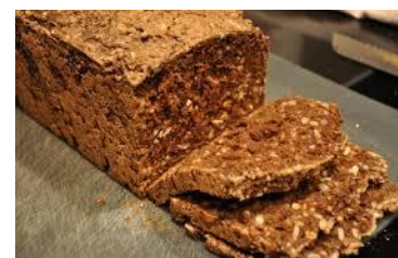
Rugbrød "Rye Bread"